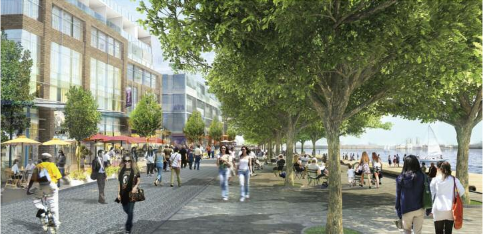
The water's edge promenade will be a picturesque destination along Toronto's waterfront.