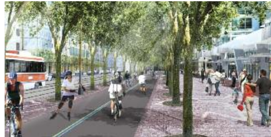
Queens Quay will bustle with newfound activity thanks to a dedicated Light Rail Transit Line*, a wide pedestrian promenade and an off-street Martin Goodman Trail.

* Source: The City of Toronto Official Plan. A future bus and LRT or other transit related uses are proposed for this location. Illustrations are artist's concept.